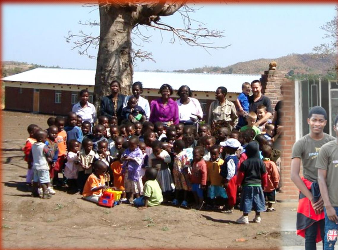
The 1 st class to start at Orbus. Kindy (Nursery) class 2010.