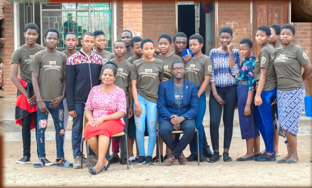
Graduating Class of 2021. The 1 st class to graduate from the Orbus Mission Secondary School.