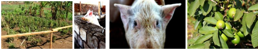
New tomato crop; pigs; guava fruit.

Good crops of maize, soya bean and pigeon peas, which we planted in late 2011 and early 2012, were harvested in April and May 2012. However as at August 2012 we are unable to report on any sales outcomes of any of these crops or on the sugar cane harvest sales, or on any of the vegetable, sunflower or other crops planted since then, as Orbus Australia has not received any news on this as yet. We hope to report on this and the current state generally of the farm, regarding the fruit trees, gum trees and other farm activity next newsletter. We can however report the good news that the goat numbers continue to increase and the pig breeding program has started well with approx. 28 new pigs born in the period. The chicken breeding program also started during the period with 300 chicks.