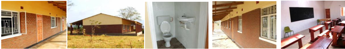
The completed new classroom building for Grades 2 and 3.

This building has big 3.5m wide verandahs on two sides and 3m on one end, with classrooms for Grades 2 and 3 as well as an office, a storeroom and three toilets. Orbus gives thanks for the contribution of the 22 local men and the men from the Frankston and Eltham Presbyterian Churches for their efforts in constructing this new building. The men worked very well together, praying at the start of each day and enjoying the combined Malawian and Australian work-site banter.