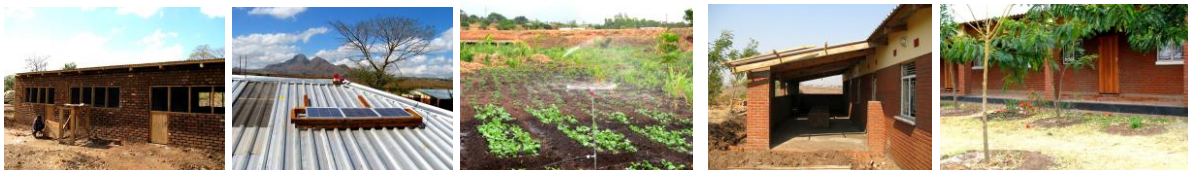
The new chicken shed; solar panels; irrigation system; and Lloyd-Jones building conversion.

The conversion of the Dr. Martyn Lloyd-Jones building into four separate, four room apartments/houses started in April 2012 and is now completed. One apartment is to be made available to foreign volunteers and three will be for teacher's accommodation. Two of the houses are to be occupied by two of the new teachers starting in late August 2012. Other improvements made to the Lloyd-Jones building have included the addition of a nice new kitchen and dining area attached to the north-eastern side of the building and the completion of the chicken shed. Also the installation of an irrigation system with pump over approx. three acres of the fertile land, and some solar panels to provide electricity for charging phone and torch batteries, as well as to power a new security alarm and light system.