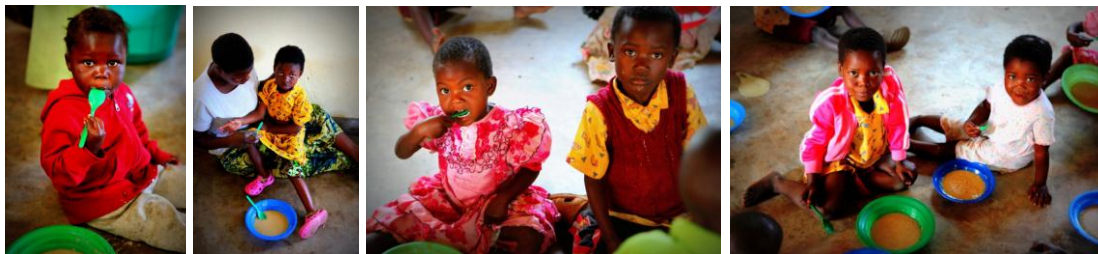
Some of the children enjoying the mid-morning porridge at the Orbus Centre in Ngumbe, Malawi.

The Orbus Centre continued to feed the children a vitamin and mineral enriched porridge every morning Monday to Friday. For some of these children this is the only nutritious daily meal they receive. The children usually approach the meal time enthusiastically and in an orderly manner, lining up beforehand to wash their hands. Volunteers assist with the cooking of the porridge in the Orbus kitchen, the serving and cleaning up afterwards.