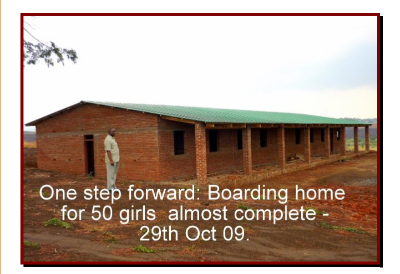
The accommodation building for 50 girls – 29<sup>th</sup> October 2009.

Orbus almost had the girl's emergency accommodation building finished late last year but a storm blew the roof off the building on the 12<sup>th</sup> November 2009 (see photos below). Thankfully this occurred before any children had moved in and by God's grace nobody was hurt. Moving forward, the Board have now negotiated and signed a contract with a Blantyre based construction company Wotazs Group Constructions to complete the girl's emergency accommodation building and the classroom building on Orbus' Ngumbe site. It is hoped that the buildings will be fully completed by the middle of the year and that Orbus will have 50 of the youngest and most vulnerable orphans in residence soon afterwards.