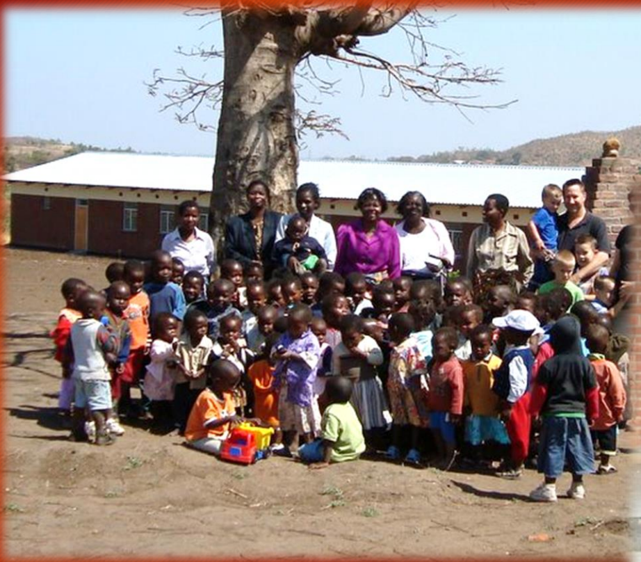
The 1 st class to start at Orbus. Kindy (Nursery) class 2010.