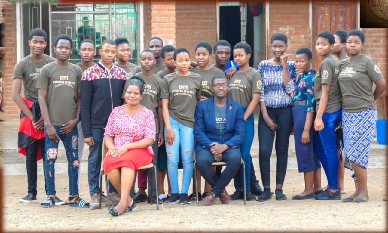
Graduating Class of 2021. The 1 st class to graduate from the Orbus Mission Secondary School.