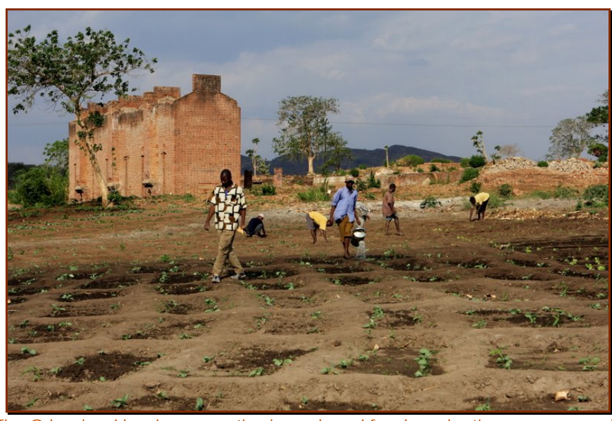
The Orbus land has been mostly cleared, and food production commenced.

Crops were planted soon after the purchase of Orbus' land with food produced from the fertile land being used to help feed the hundreds of orphaned children who come to the Namatete CCAP feeding and teaching program every Saturday.